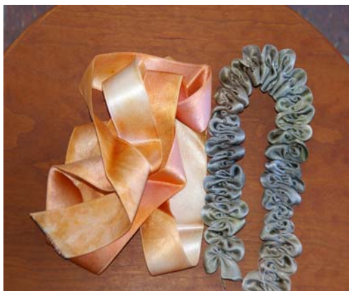
Silk Satin ribbon in copper Rose on Left & Weathered Basket Rouché on Right